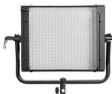
VELVET POWER 1 WEATHERPROOF/STUDIO