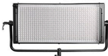
VELVET POWER 2 WEATHERPROOF/STUDIO